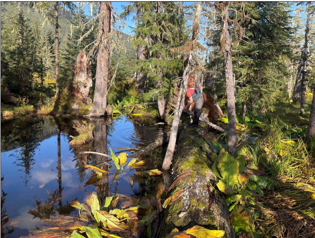
Figure 4.—Agency staff surveying ponded water at waypoint 841.