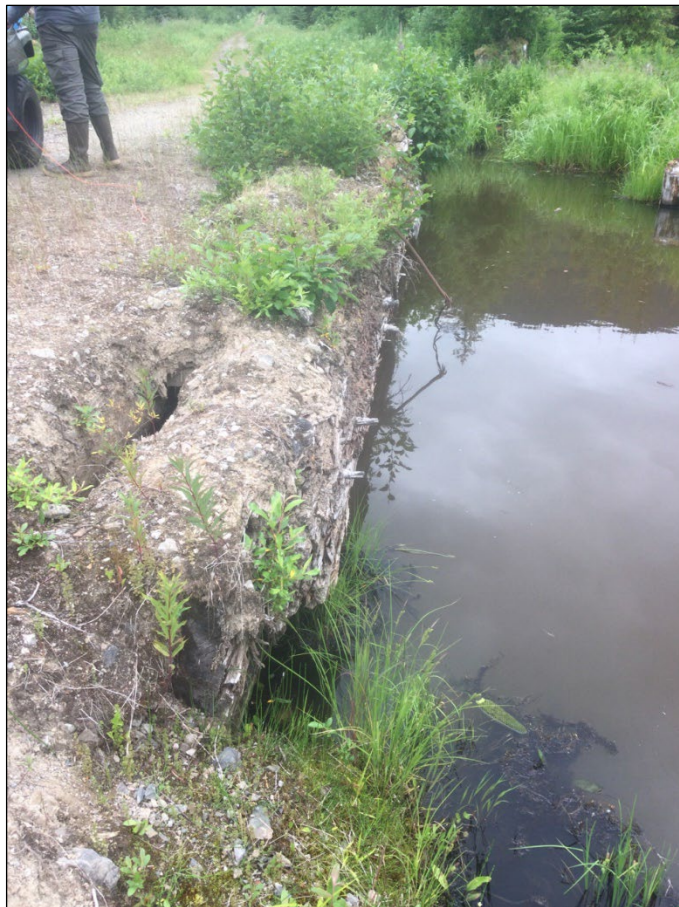
Figure 2.–Bridge and ponding at waypoint 945.