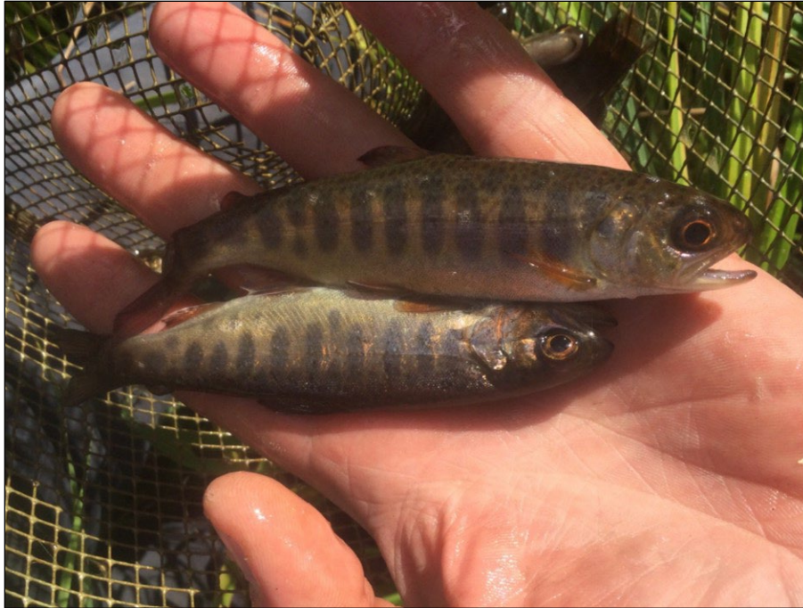
Figure 1.–Juvenile coho salmon captured at waypoint 1734.