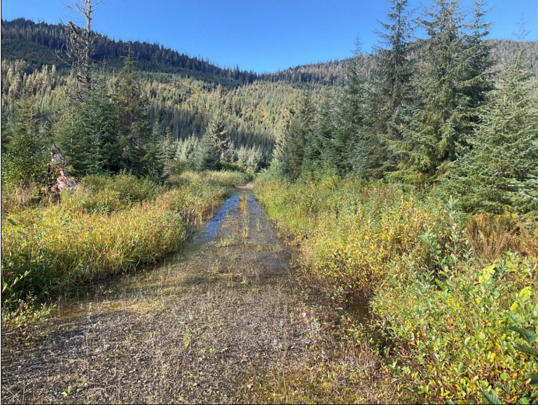
Figure 3.—Stream fording the road at waypoint 838.