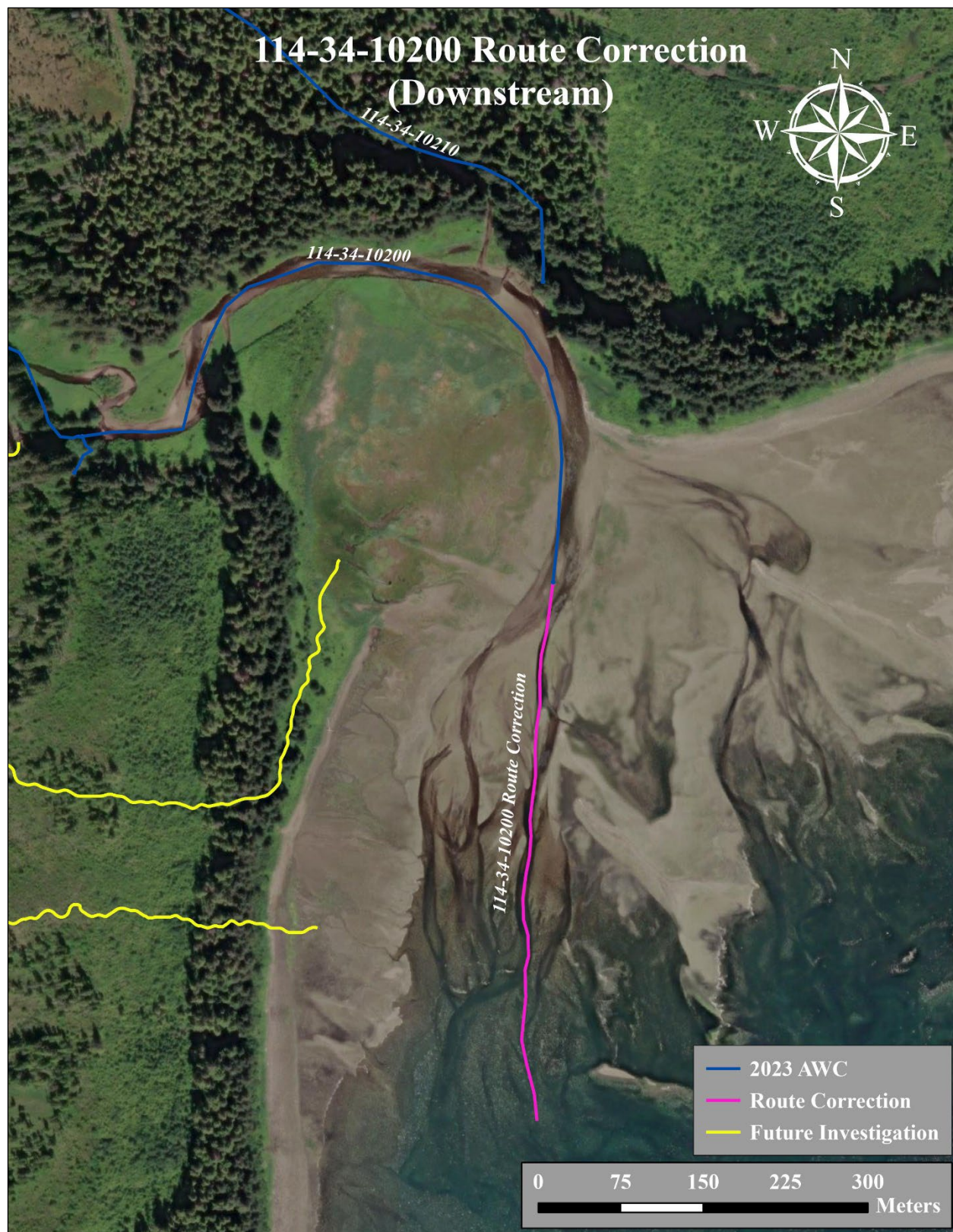
Figure 6.—114-34-10200 route correction (downstream) map.